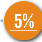
OREGON CHILDREN IN POVERTY WITH ACCESS TO EARLY HEAD START