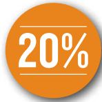
CHILDREN IN OREGON WHO EXPERIENCE CHILDHOOD TRAUMA