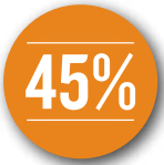
BABIES BORN IN OREGON EACH YEAR WHO QUALIFY FOR MEDICAID